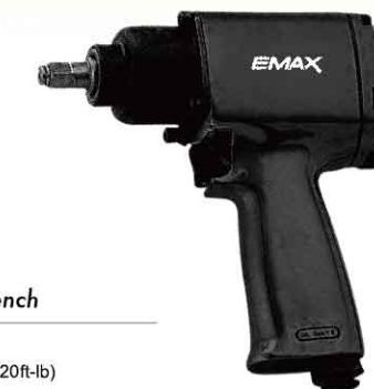
AT-5036 3/8"DR. Impact Wrench

- ROCKING CLUTCH - MAX TORQUE: 102 Nm( 75ft-lb)