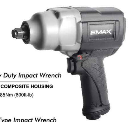
AT-1480 1/2"DR. Heavy Duty Impact Wrench - TWIN HAMMER / COMPOSITE HOUSING - MAX TORQUE: 1085Nm (800ft-lb)