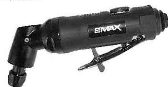
AT-R2115L(M) 1/4" (6mm) 115° Angle Die Grinder