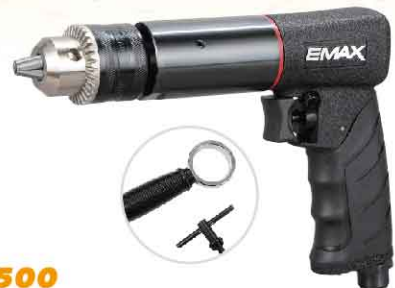
AT-4500 1/2" Reversible Drill

- COMPOSITE HOUSING - FREE SPEED: 800RPM