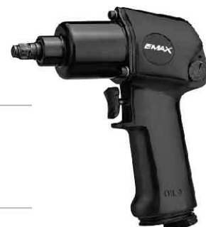
AT-5029A 1/2"DR. Impact Wrench

- ROCKING CLUTCH - MAX TORQUE: 257 Nm( 190ft-lb)