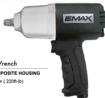
AT-1063A 3/8"DR. Impact Wrench

- TWIN HAMMER / COMPOSITE HOUSING - MAX TORQUE: 379 Nm ( 280ft-lb)