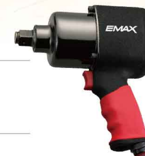
AT-6067B 1"DR. Impact Wrench