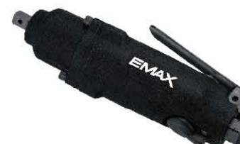
AT-3020W 3/8"DR. In-Line Impact Wrench

- JUMBO CLUTCH - MAX TORQUE: 407 Nm( 300ft-lb)