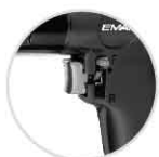
AT-4041 1/2" Reversible Drill