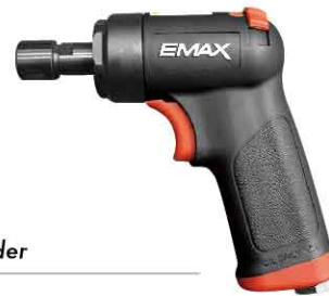
AT-2366(M) 1/4" (6mm) Die Grinder

- RUBBER HANDLE - COMPOSITE HOUSING / FREE SPEED: 16,000RPM