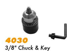
4030 3/8" Chuck & Key