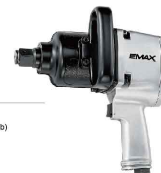
AT-6083P-8 1"DR. Impact Wrench