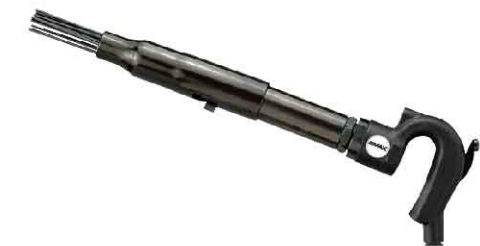
AT-2368NS Heavy Duty Needle Scaler - NO. OF NEEDLE: 3*180MM x 19PCS