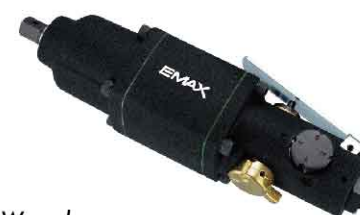
AT-3010JW 3/8"DR. In-Line Impact Wrench

- JUMBO CLUTCH - MAX TORQUE: 100 Nm( 74ft-lb)