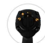
AT-5140N 1/2" DR. Torque Limited Impact Wrench - TWIN HAMMER - MAX FORWARD TORQUE: 90Nm(65ft-lb) - MAX REVERSE TORQUE: 880Nm(642ft-lb)