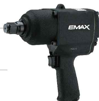
AT-2066-6 3/4"DR. Impact Wrench