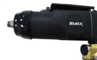
AT-5030 3/8"DR. Butterfly Impact Wrench

- TWIN HAMMER / COMPOSITE HOUSING - MAX TORQUE: 298 Nm ( 220ft-lb)