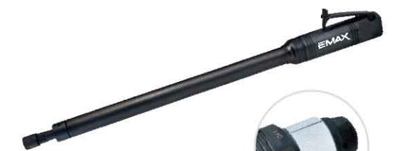
AT-7082XL(M)(G) 1/4" (6mm) Extended Die Grinder