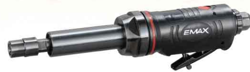
AT-7033DL(M) 1/4" (6mm) Extended Die Grinder