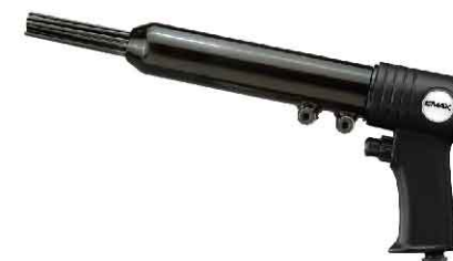
AT-2720 Pistol Type Needle Scaler - NO. OF NEEDLE: 3*180MM x 19PCS