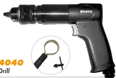
AT-4040 1/2" Drill