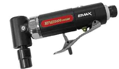
AT-7034C(M) 1/4" (6mm) Angle Die Grinder