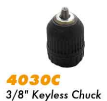
4030C 3/8" Keyless Chuck