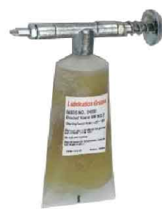
AT-6047 - CAPACITY CARTRIDGE: 3.5OZ