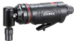
AT-7034D(M) 1/4" (6mm) Angle Die Grinder

- RUBBER HANDLE - LOW SPEED TYPE / FREE SPEED: 4,500RPM