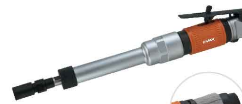
AT-7080L(M)(G) 1/4" (6mm) Extended Die Grinder