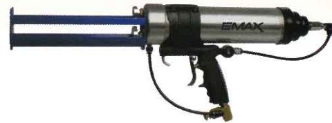
AT-2252M Dual Component Caulking Gun - CAPACITY GLUE: 390ML