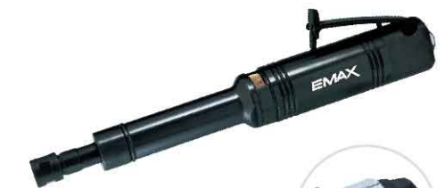
AT-7082L(M)(G) 1/4" (6mm) Extended Die Grinder