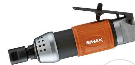
AT-7081(M)(G) 1/4" (6mm) Die Grinder