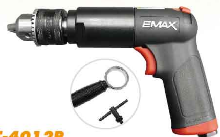
AT-4012P 1/2" Reversible Drill

- COMPOSITE HOUSING - FREE SPEED: 800RPM