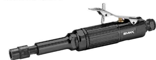
AT-7134(M) 1/4" (6mm) Extended Die Grinder

- 3" LONG-EXTENDED TYPE / FREE SPEED: 25,000RPM