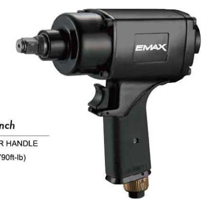
AT-5047A 1/2"DR. Impact Wrench - TWIN HAMMER / RUBBER HANDLE - MAX TORQUE: 1071Nm (790ft-lb)