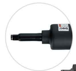
AT-2030S 1/2"DR. Impact Wrench - TWIN HAMMER - MAX TORQUE: 759Nm (560ft-lb)