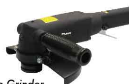
AT-7041 7" Industrial Angle Grinder

- FREE SPEED: 11,000RPM / LEVER TYPE (ROLL TYPE)