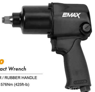
AT-1260 1/2"DR. Impact Wrench - TWIN HAMMER / RUBBER HANDLE - MAX TORQUE: 576Nm (425ft-lb)