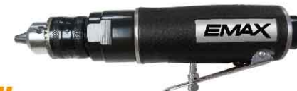
AT-4038H 3/8" Straight Drill