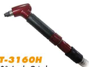
AT-3160H 120° Angle Grinder