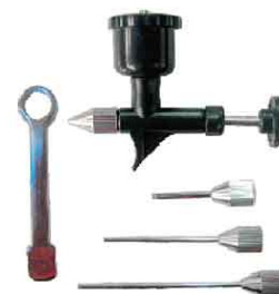
PHS80K Mini Grease Gun Kit - CAPACITY BULK: 10C.C.