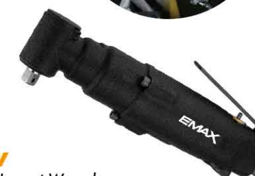
AT-3040W 3/8"DR. Corner Impact Wrench

- TWO HAMMER/ 90°ANGLE HEAD - MAX TORQUE: 65 Nm( 48ft-lb)