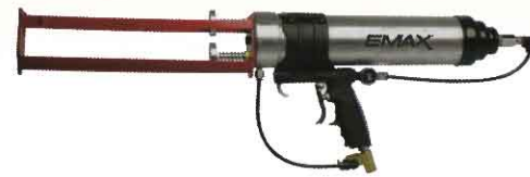
AT-2253M Dual Component Caulking Gun - CAPACITY GLUE: 600ML