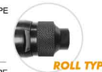
AT-7036(G) 4" Angle Grinder

- FREE SPEED: 11,000RPM / LEVER TYPE (ROLL TYPE)