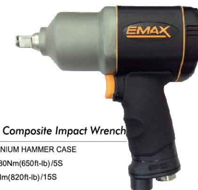
AT-5140T 1/2" DR. Titanium Composite Impact Wrench - TWIN HAMMER / TITANIUM HAMMER CASE - WORKING TORQUE: 880Nm(650ft-lb)/5S - MAX TORQUE: 1112Nm(820ft-lb)/15S