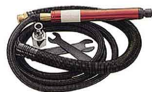
AT-3170 Micro Grinder