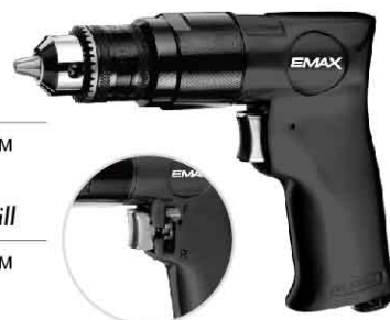
AT-4031 3/8" Reversible Drill