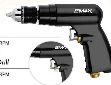
AT-4037A 3/8" Reversible Drill