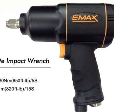
AT-5140 1/2" DR. Composite Impact Wrench - TWIN HAMMER - WORKING TORQUE: 880Nm(650ft-lb)/5S - MAX TORQUE: 1112Nm(820ft-lb)/15S

360 degree swivel air inlet to prevent air hose twisted.