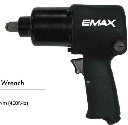
AT-5044 1/2"DR. Impact Wrench - TWIN HAMMER - MAX TORQUE: 542Nm (400ft-lb)