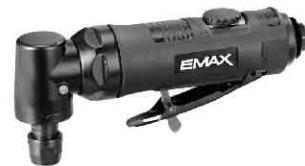
AT-R7136L(M) 1/4" (6mm) Angle Die Grinder