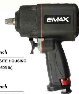
AT-3260A 1/2"DR. Impact Wrench - TWIN HAMMER / COMPOSITE HOUSING - MAX TORQUE: 1288Nm (950ft-lb)