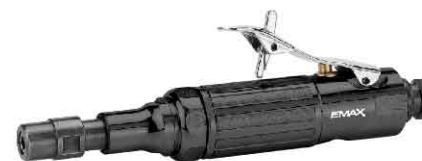
AT-7133(M) 1/4" (6mm) Extended Die Grinder