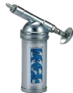
AT-6046 Mini Grease Gun - CAPACITY BULK: 80C.C.