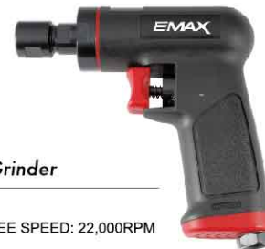
AT-2367(M) 1/4" (6mm) Mini Die Grinder

- RUBBER HANDLE - COMPOSITE HOUSING / FREE SPEED: 16,000RPM