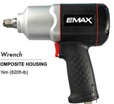
AT-1015 1/2"DR. Impact Wrench - TWIN HAMMER / COMPOSITE HOUSING - MAX TORQUE: 1112Nm (820ft-lb)