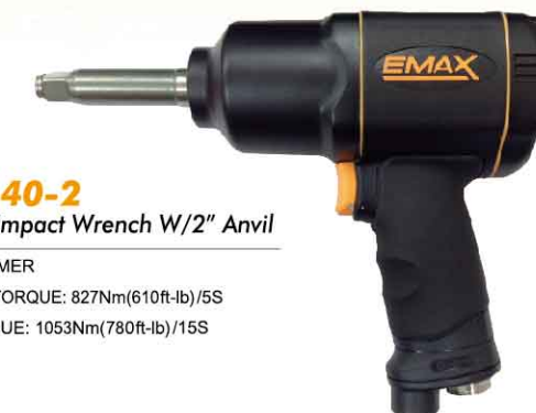
AT-5140-2 1/2" DR. Impact Wrench W/2" Anvil - TWIN HAMMER - WORKING TORQUE: 827Nm(610ft-lb)/5S - MAX TORQUE: 1053Nm(780ft-lb)/15S