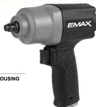
AT-1351 3/8"DR. Impact Wrench

- TWIN HAMMER / COMPOSITE HOUSING - MAX TORQUE: 379 Nm ( 280ft-lb)