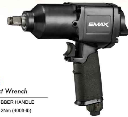
AT-5042 1/2"DR. Impact Wrench - PIN CLUTCH / RUBBER HANDLE - MAX TORQUE: 542Nm (400ft-lb)