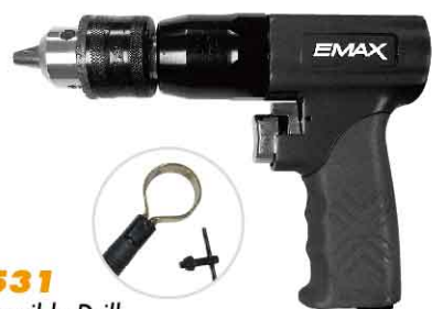
AT-4531 1/2" Reversible Drill