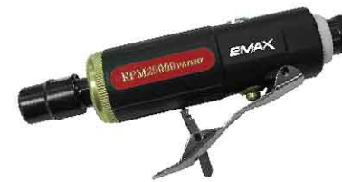
AT-7132(M) 1/4" (6mm) Die Grinder