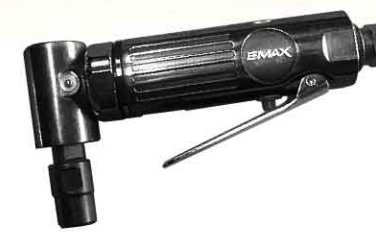
AT-7034(M) 1/4" (6mm) Angle Die Grinder