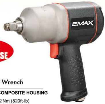
AT-1063 1/2"DR. Impact Wrench - TWIN HAMMER / COMPOSITE HOUSING - MAX TORQUE: 1112Nm (820ft-lb)