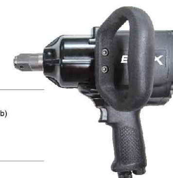
AT-6962-6 1"DR. Impact Wrench