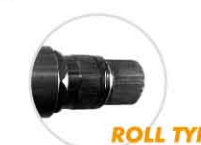
AT-7044G 4" Industrial Angle Grinder