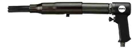
AT-2168NS Pistol Type Needle Scaler - NO. OF NEEDLE: 3*180MM x 19PCS