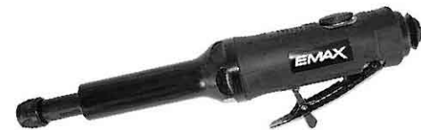
AT-R7135L(M) 1/4" (6mm) Extended Die Grinder