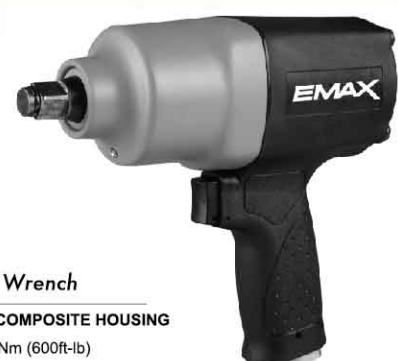
AT-1454 1/2"DR. Impact Wrench - TWIN HAMMER / COMPOSITE HOUSING - MAX TORQUE: 814Nm (600ft-lb)