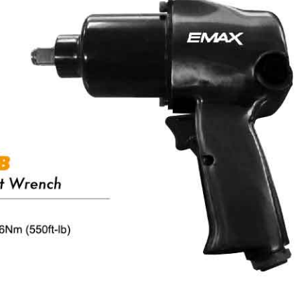
AT-5044B 1/2"DR. Impact Wrench - TWIN HAMMER - MAX TORQUE: 746Nm (550ft-lb)