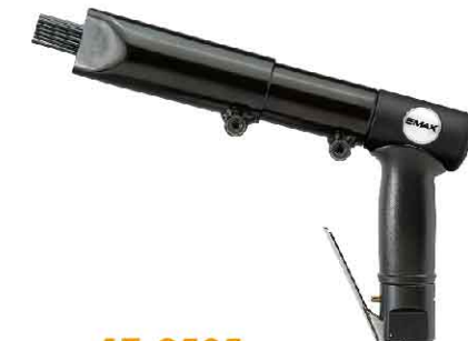
AT-2505 Pistol Type Needle Scaler - NO. OF NEEDLE: 3*180MM x 19PCS