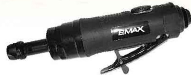
AT-R7245L(M) 1/4" (6mm) Die Grinder