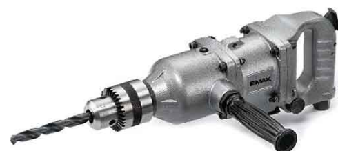
AT-26D 5/8" HD. Reversible Drill