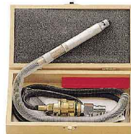
AT-3180 Micro Grinder