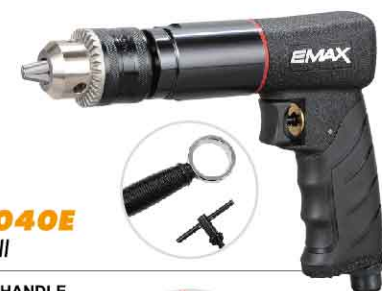
AT-4040E 1/2" Drill