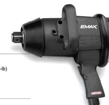
AT-6087P-6 1"DR. Impact Wrench