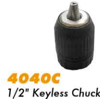
4040C 1/2" Keyless Chuck