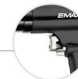
AT-4035 3/8" Angle Drill