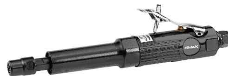
AT-7033L(M) 1/4" (6mm) Extended Die Grinder

- RUBBER HANDLE - COMPOSITE HOUSING / FREE SPEED: 22,000RPM