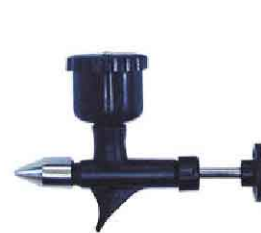
PHS80 Mini Grease Gun - CAPACITY BULK: 10C.C.