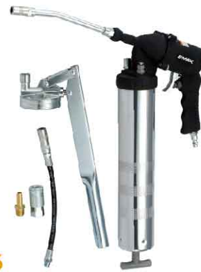
AT-6036-6 Grease Gun - CAPACITY CARTRIDGE: 14OZ (BULK: 400C.C.) - W/ 6PCS ACCESSORIES