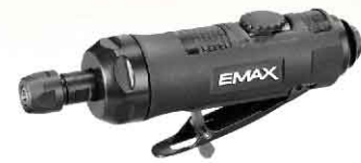
AT-R7033L(M) 1/4" (6mm) Die Grinder