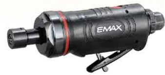
AT-7033D(M) 1/4" (6mm) Die Grinder