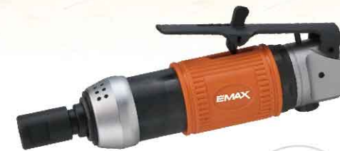
AT-7080(M)(G) 1/4" (6mm) Die Grinder