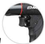
AT-4012 1/2" Reversible Drill