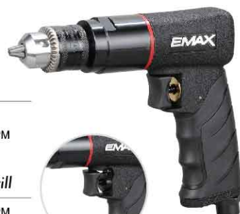
AT-3038 3/8" Reversible Drill