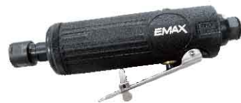
AT-7032(M) 1/4" (6mm) Mini Die Grinder