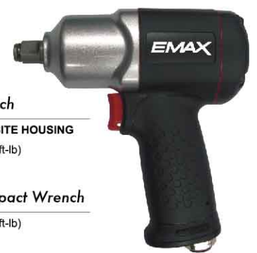
AT-1064 3/8"DR. Impact Wrench - TWIN HAMMER / COMPOSITE HOUSING - MAX TORQUE: 678Nm (500ft-lb)