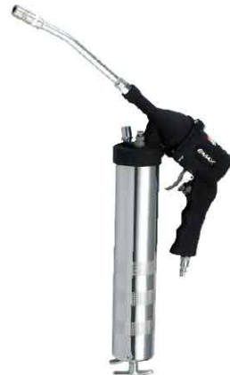
AT-6036 Grease Gun - CAPACITY CARTRIDGE: 14OZ (BULK: 400C.C.)