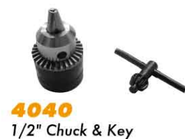
4040 1/2" Chuck & Key