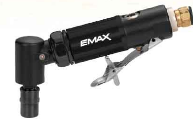
AT-71363(M) 1/4" (6mm) 115° Angle Die Grinder