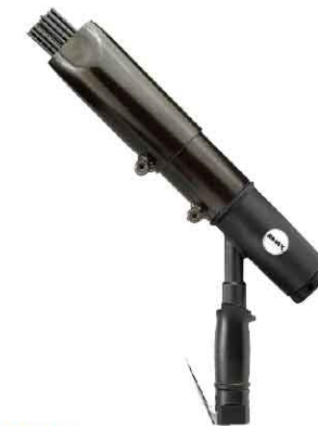
AT-2504 Pistol Type Needle Scaler - NO. OF NEEDLE: 4*180MM x 35PCS