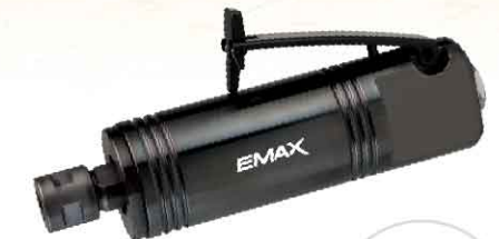
AT-7082(M)(G) 1/4" (6mm) Die Grinder