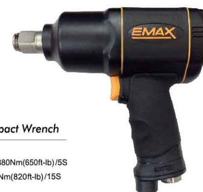
AT-5160 3/4" DR. Mini Impact Wrench - TWIN HAMMER - WORKING TORQUE: 880Nm(650ft-lb)/5S - MAX TORQUE: 1112Nm(820ft-lb)/15S